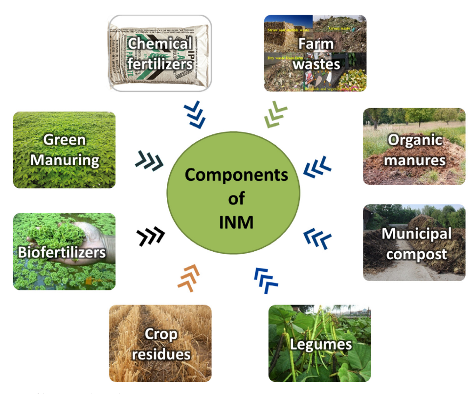
Fig. 1. Components of integrated nutrient management

demands, what kind of nutrient is available in general in soil and in the farmer's hand, and which materials can be safely used to increase nutrient-use efficiency are all factors that influence INM.